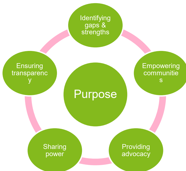
Figure 1: The Purpose of Consumer & Community Engagement in the Bay of Plenty

The HCC identified five key purposes for consumer and community engagement: (1) Identifying Gaps, (2) Empowering communities, (3) Providing advocacy, (4) Sharing power, and (5) Ensuring transparency.